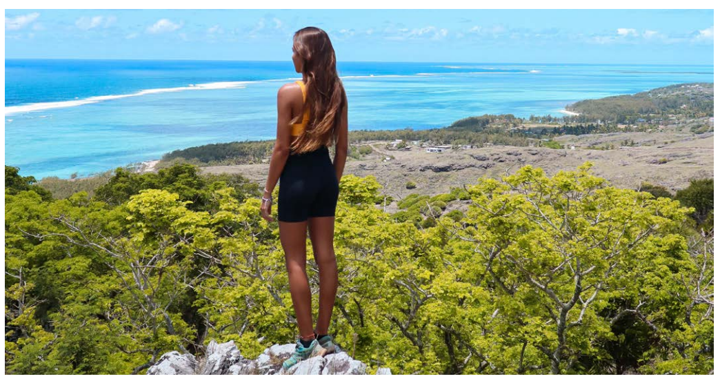
FOR A FEE Hiking Trek Off Road in 4x4 Bikes & Scooter Rental Excursions - Rodrigues Discovery Boat Trip (Fishing & Snorkelling)