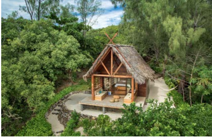
North Beach Villas

Every villa is unique and looks out on to the sea. They are built with a thatched roof and have a private terrace. They are all equipped with fans, minibar, safe and kimono, a bathroom with shower and a separate toilet, a private terrace with two wooden chairs. Each villa will have 2 loungers and 1 umbrella provided on the beach.