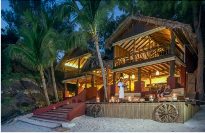
The Restaurant (60 seats)

The Restaurant has a surface area of 135m 2 . The breakfast buffet is open from 7.30 to 10.00. Lunch in a buffet style is served from 13.00 to 14.30 and dinner, (3 courses) is served as from 20.00. Cuisine consists mainly of freshly caught sea foods. For an additional fee, you can be served a seafood platter on the beach.