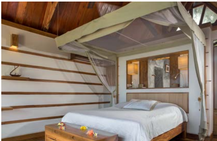
South Beach Villas

13 Beach Villas (47m 2 ) are located side by side along the North Beach of Constance Tsarabanjina. The villas are completely air-conditioned.