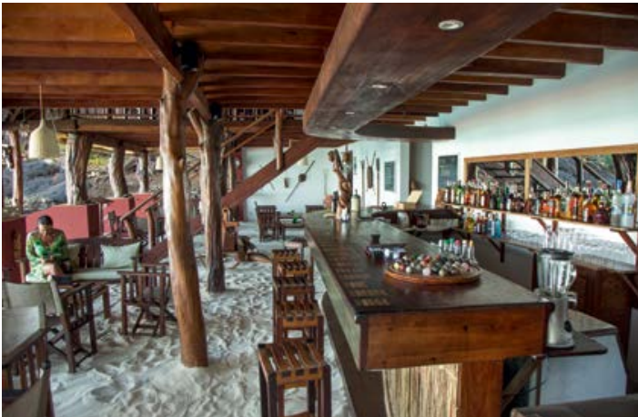
The Bar (45 seats)

The Restaurant has a surface area of 135m 2 . The breakfast buffet is open from 7.30 to 10.00. Lunch in a buffet style is served from 13.00 to 14.30 and dinner, (3 courses) is served as from 20.00. Cuisine consists mainly of freshly caught sea foods. For an additional fee, you can be served a seafood platter on the beach.